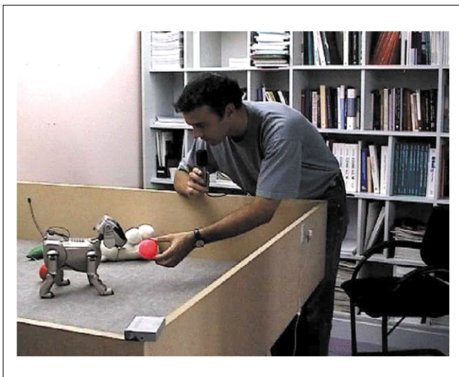
Fig. 1. The AIBO™ pet robot has been used in experiments to see how language-like communication in robots might be bootstrapped by interaction with a human mediator. Reproduced with permission from Ref. [12].

Figure 2 shows the set-up of a large-scale grounded language game experiment, with which a population of thousands of agents has played close to half a million guessing games [18]. The objective of this ‘Talking Heads