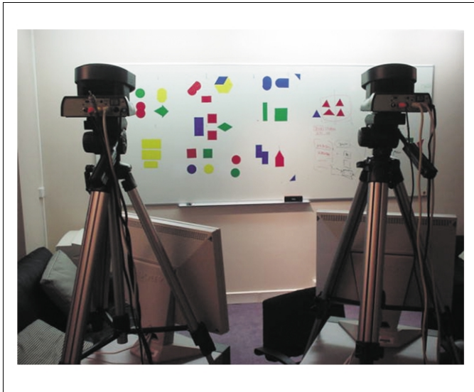
Fig. 2. The 'Talking Heads' experiment featured two pan-tilted cameras oriented towards a white board on which geometric figures were pasted. Agents used these cameras to play lexical games drawing attention to a chosen figure, which is the 'topic' of that game.

experiment' was to show how such a population would be able to generate and self-organize a shared lexicon as well as the perceptually grounded categorizations of the world expressed by this lexicon, all without human intervention or prior specification.