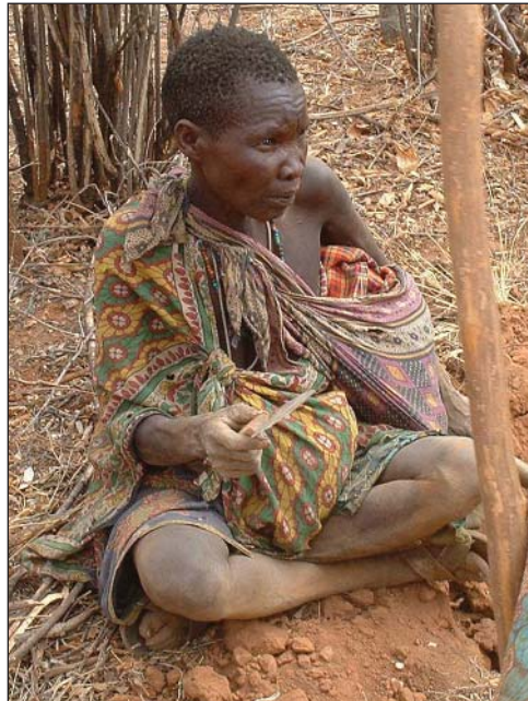
All alone. Researchers ponder why the Hadzabe live so far from other click speakers.