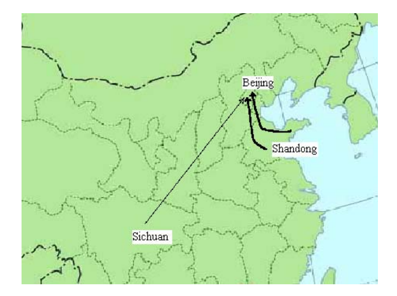
Figure 1: Migrations to Pekinese-speaking area

Two thicker lines indicate the strains from East and West of Shandong; while the thinner line shows the trace of population from Southwestern Mandarin district.