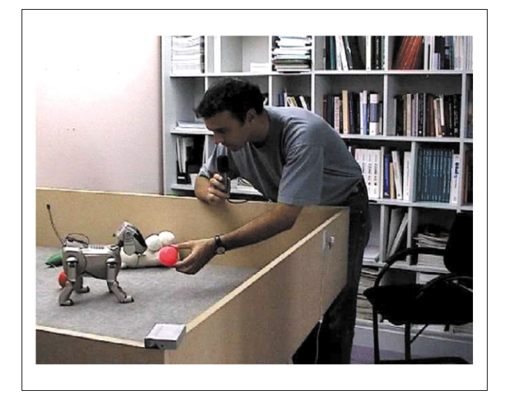
Fig. 1. The AIBO<sup>TM</sup> pet robot has been used in experiments to see how language-like communication in robots might be bootstrapped by interaction with a human mediator. Reproduced with permission from Ref. [12].

There is a general consensus that pre-programmed communication is inadequate for these new generations of robots and software agents. First, the environment in