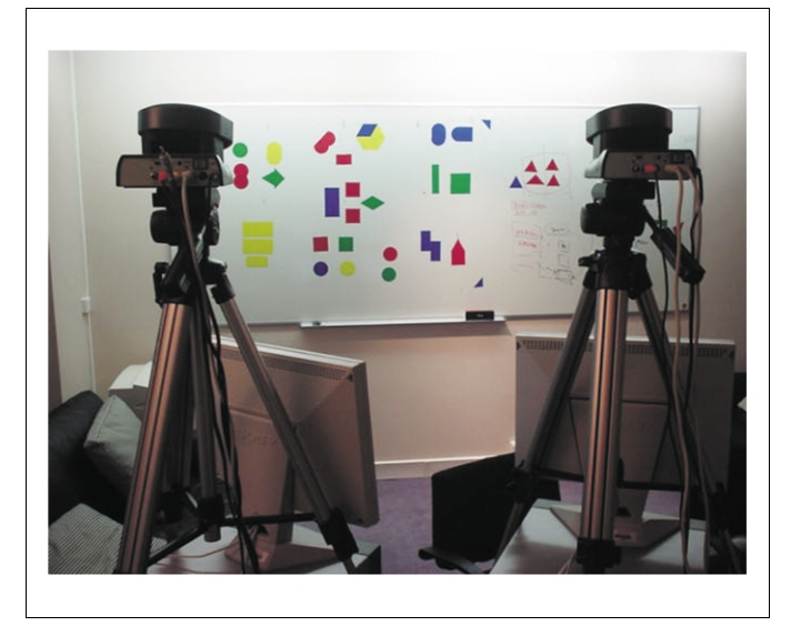
Fig. 2. The 'Talking Heads' experiment featured two pan-tilted cameras oriented towards a white board on which geometric figures were pasted. Agents used these cameras to play lexical games drawing attention to a chosen figure, which is the 'topic' of that game.

experiment' was to show how such a population would be able to generate and self-organize a shared lexicon as well as the perceptually grounded categorizations of the world expressed by this lexicon, all without human intervention or prior specification.