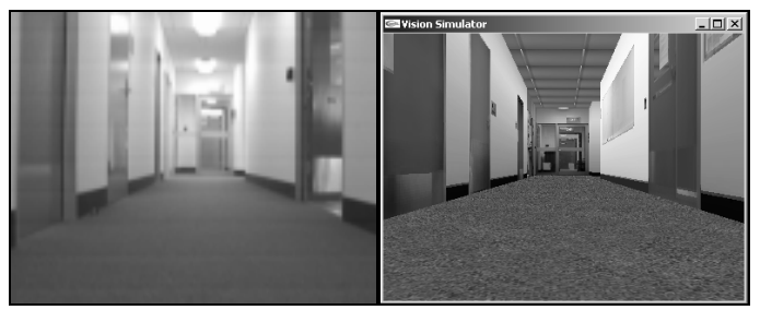
Figure 2 The robot's world comprises halls and open plan offices. A simulated world has been built to mirror the real world. The features of the environment shown in the visual images seen by the robot include the floor, walls, desks, chairs, and filing cabinets. The left image is from the robot's camera and the right image is the same location in the simulated world.

The RatChat language agents consist of a speaker and a listener based on simple recurrent neural networks (Elman, 1990; Tonkes, Blair, & Wiles, 2000). Speaker networks are extended to include the output of the network in the context for the next time step. Preliminary simulations showed that languages are easier to learn when the meaning space patterns are nonorthogonal and that distributed representations in signal space enable expressive languages to be found more easily than if localist representations are used.