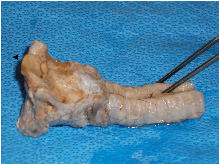
Figure 1. Larynx of a female Bonobo that shows the rather horizontal position of the epiglottis.